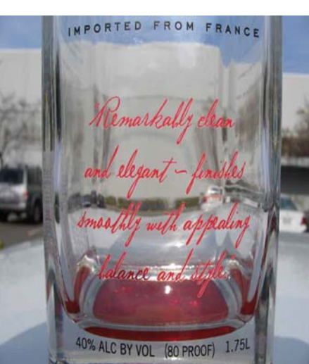
Image Type: Other Actual Dimensions: 2.13 inches W X 2.63 inches H