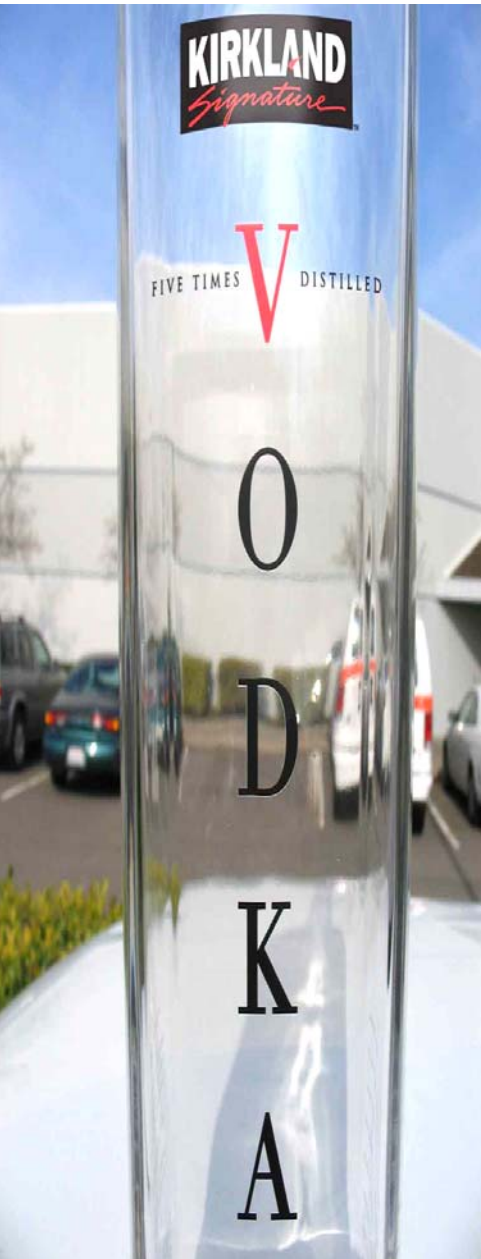
Image Type: Brand (front) Actual Dimensions: 2.31 inches W X 2.62 inches H

AFFIX COMPLETE SET OF LABELS BELOW Image Type: Brand (front) Actual Dimensions: 2.5 inches W X 6.53 inches H